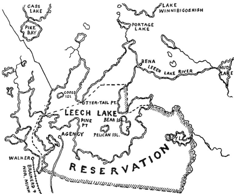
MAP OF THE LOCALITY OF THE INDIAN HOSTILITIES

[Redrawn from sketches in the St. Paul Pioneer Press , October 6, 8, 1898.]