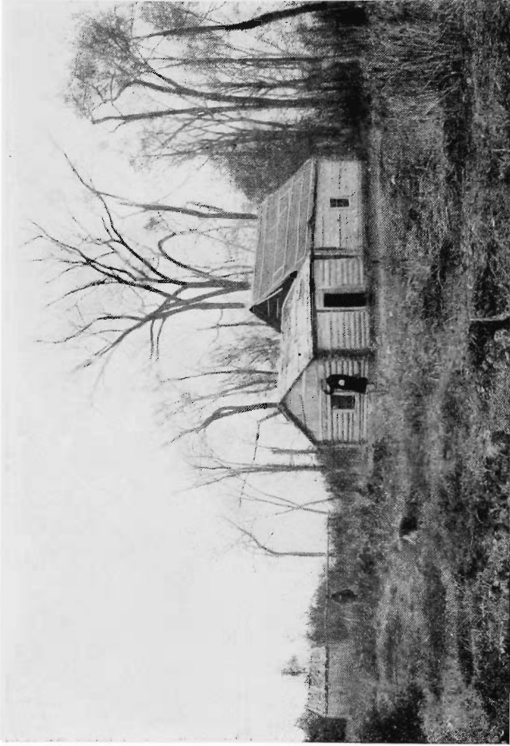
PART OF THE LEECH LAKE BATTLE GROUND