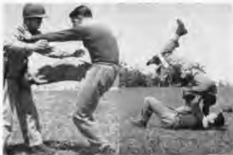
32, 33 (right above)

In practice place the foot in your partner's stomach so that no one will get hurt. But when close to the enemy kick him in the testicles as hard as you possibly can.