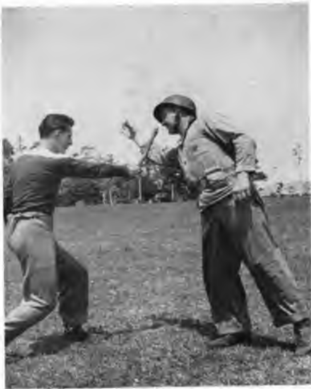
Use Of The Club Or Blackjack