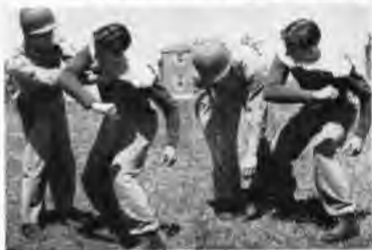
35 left — 36 (right above)

Maintain your own balance at all times during this circling arm break. Especially maintain your balance at the finish of the break so you can immediately follow up the attack with elbows and knees.