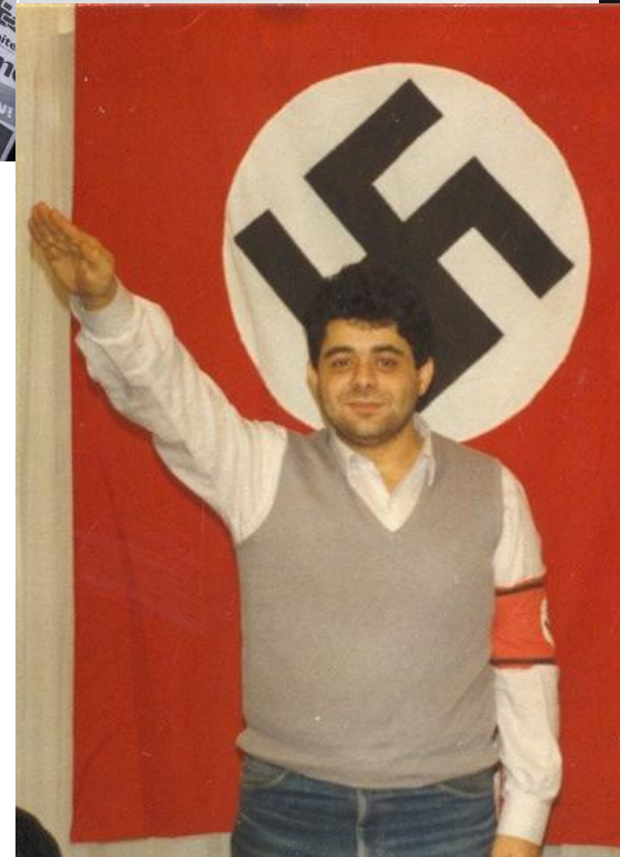
A young Nikolaos Michaloliakos imprisoned leader of the Golden Dawn attending a CEDADE meeting.