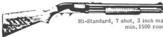
Hi-Standard, 7 shot, 3 inch magnum shotgun min. 1500 rounds

The NSLF is a political, revolutionary army. The organization revolves around a militant strategy of ARMED GUERRILLA STRUGGLE against the Jewish power structure. Consequently the underground leadership has determined that those who will participate in the "armed struggle" will be organized and ARMED in a uniform manner. We are a disciplined ARMY whose aim is the total destruction of the anti-White system and the creation of a National Socialist State! Therefore, all members of the "Central Organization" will acquire the following equipment. Suggestions for modification will be considered but as it stands now, the following equipment is required and must be obtained by all present "Central Organization" members by March 1975. Any C.O. member who has not completed these requirements or who does not have a valid excuse for failure to comply will be removed to the General Membership roster.